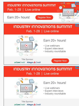
Tablet base, expanded, and expanded without CTA button