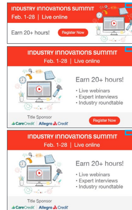
Mobile base, expanded, and expanded without CTA button